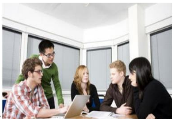
Figure 2: Practice